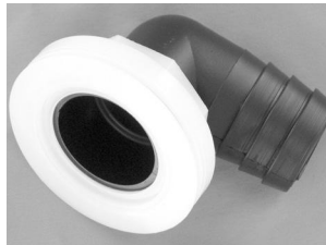
4116 - Short Thread with Crosshairs