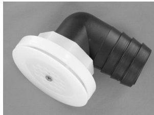
4130 - Long Thread with Anti-Slosh Valve