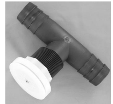
4136 - "T" Drain with Anti-Slosh Valve