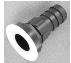
4058 - Straight Drain