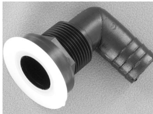
4057 - Long Thread with Crosshairs