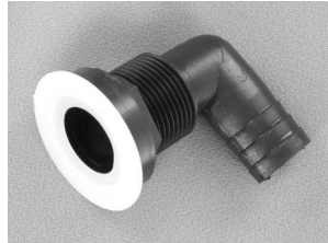
4056 - Long Thread with Crosshairs